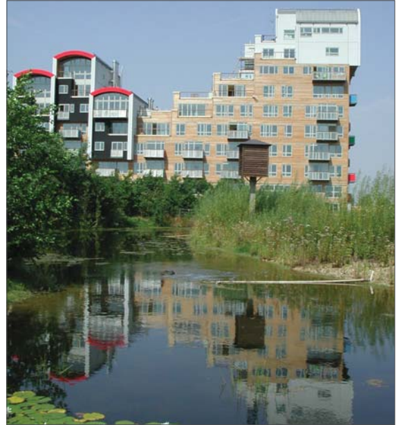
View across the ecology park to phase 1

Detailed landscape proposals created a spatial hierarchy of urban squares, streets and courtyards arranged around an ecology park which serves both as recreational space and an extension of the Thames into the heart of the village. The landscape is used as an organisational framework, giving pedestrians and cyclists priority over vehicle movement and creating a network of living streets designed to stimulate community interaction. High quality hard and soft materials and street furniture elements were selected to give continuity between phases of the development and compliment the materials used on the wider Peninsula.