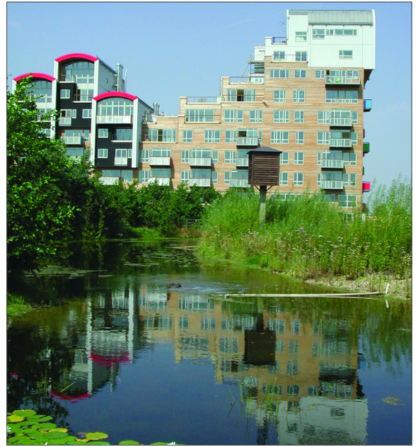
View across the ecology park to phase 1

Detailed landscape proposals created a spatial hierarchy of urban squares, streets and courtyards arranged around an ecology park which serves both as recreational space and an extension of the Thames into the heart of the village. The landscape is used as an organisational framework, giving pedestrians and cyclists priority over vehicle movement and creating a network of living streets designed to stimulate community interaction. High quality hard and soft materials and street furniture elements were selected to give continuity between phases of the development and compliment the materials used on the wider Peninsula.