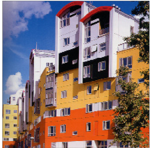
View of phase 1 buildings