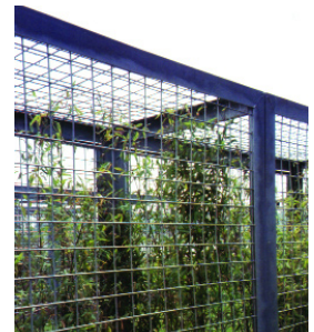
Marketing Suite landscape elements