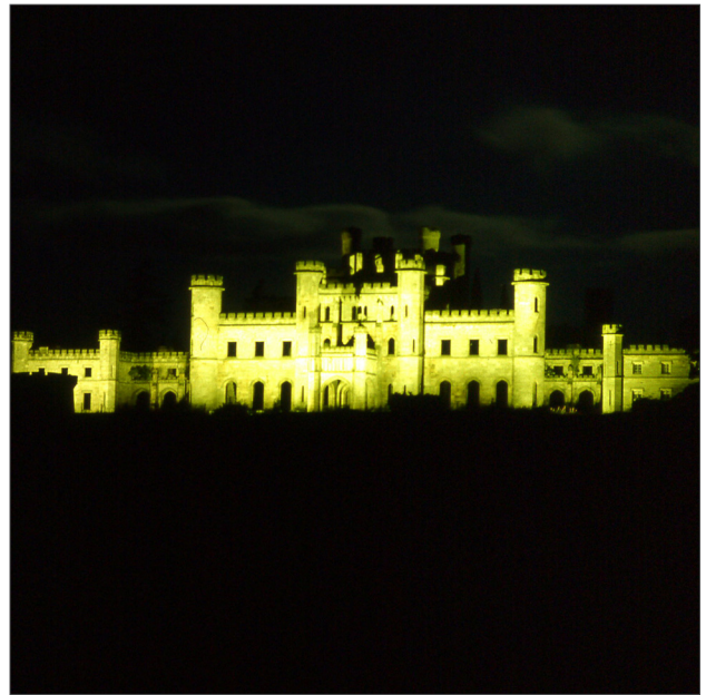
Lowther Castle, Night View