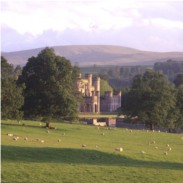
Lowther Castle, Day View