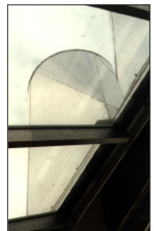
Single Wind Tower

London UK Office T: +44 (0)20 7440 8282 F: +44 (0)20 7440 8292 E: admin@battlemccarthy.com www.battlemccarthy.com